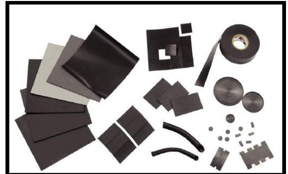
Figure #1 MAJRabsorber configurations

The test set-up without the MAJRabsorber was used to establish a 0dB reference across the full frequency range of 1 GHz to 18 GHz. A sheet of MAJRabsorber was placed between antennas to establish the attenuation (dB) vs. frequency (GHz) plot in Figure #3.