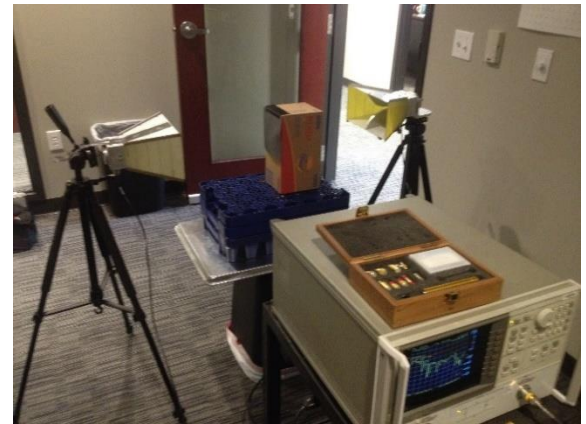
Figure #2 Radiated testing of MAJRabsorber